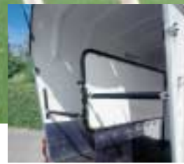
The chest- and the butt bars can easily be set in different heights in order to adapt the horsetrailer to different horses.