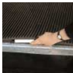
Shock-absorbent, ribbed, removable rubber mat provides optimal protection for the horses legs.