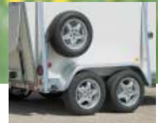
Accessories/extra equipment, page 9