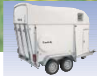
Royal horse trailer, page 7