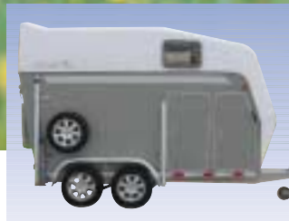
Baron horse trailer, page 4