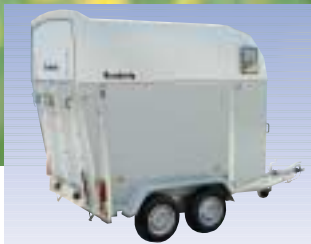
Prestige horse trailer, page 6