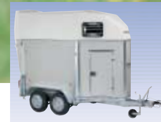
Solo horse trailer, page 8