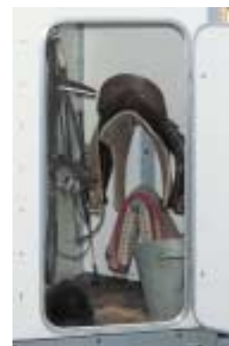
The Royal TC model features a built-in tack compartment with an interior light and holders for two saddles.