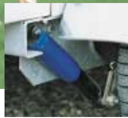
The special rubber torsion axles provide individual suspension on all four wheels – resulting in a smooth and comfortable ride.