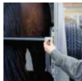
Easy to open or close the butt bars. Snap release system on the butt bars.